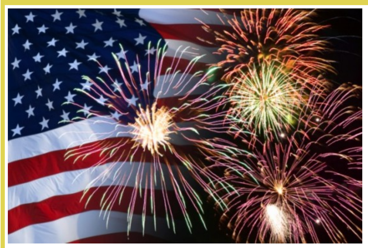
Happy Summer from CRS!

Making a difference. Right here at home.